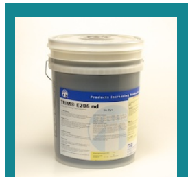
5-gallon pail SKU: E206NDN/5 UPC-12: 641238003151