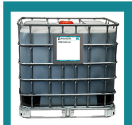
270-gallon tote SKU: E206NDN/NR270P UPC-12: 641238034063