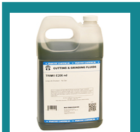
1-gallon jug SKU: E206NDN/1 UPC-12: 641238003144