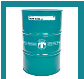
54-gallon drum SKU: E206NDN/54 UPC-12: 641238003168